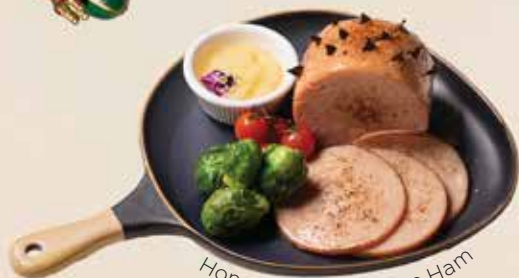
Honey Baked Chicken Ham

Menus are available from 15 Nov 2024 - 5 Jan 2025, exceptions apply. Minimum spending required. Prices are subjected to 9% GST. Other charges and prevailing taxes apply. Photos are for illustration purposes only. Other Terms & Conditions apply. For more information, please visit lavish.com.sg