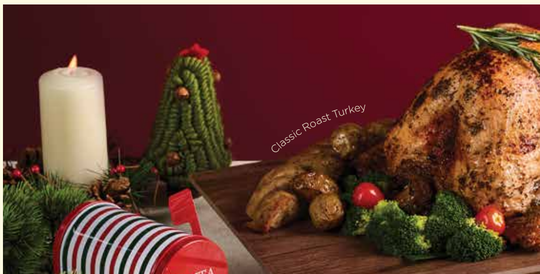
Classic Roast Turkey