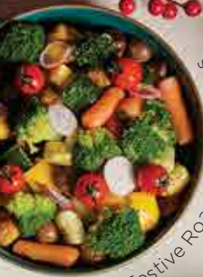
Festive Roasted Vegetables