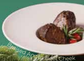
Braised Angus Beef Cheek