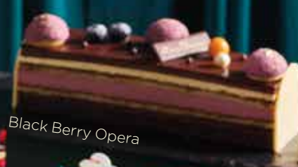
Black Berry Opera