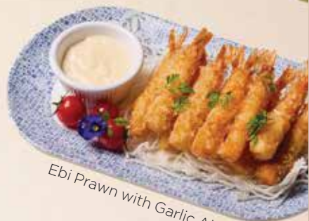
Ebi Prawn with Garlic Aioli