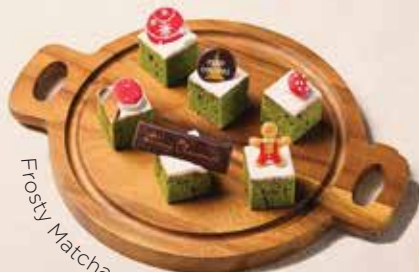
Frosty Matcha Adzuki Cake