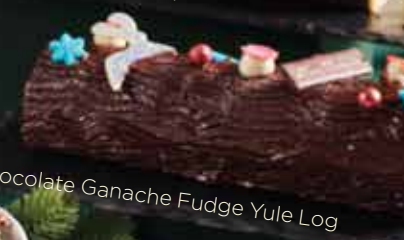
Chocolate Ganache Fudge Yule Log