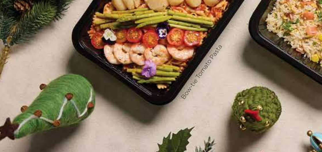
Bow-tie Tomato Pasta