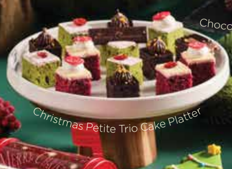
Christmas Petite Trio Cake Platter