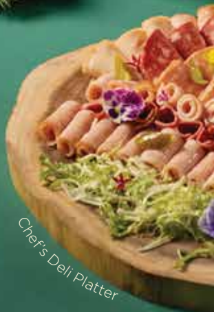
Chef's Deli Platter