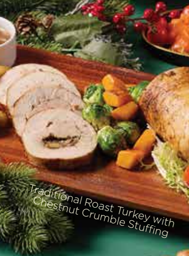
Traditional Roast Turkey with Chestnut Crumble Stuffing