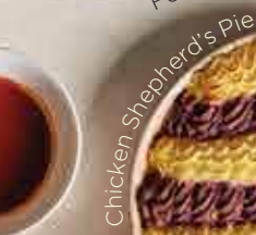
Chicken Shepherd's Pie