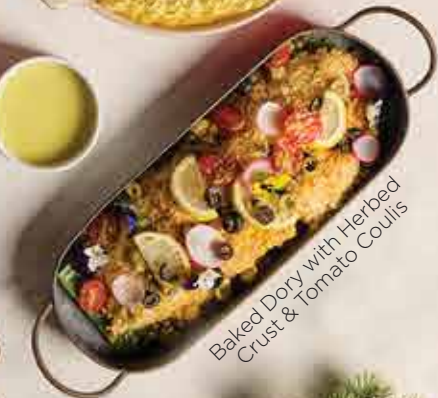
Baked Dory with Herbed Crust & Tomato Coulis