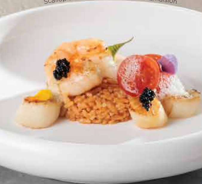
Scallop & Prawn Duet with Laksa Emulsion

W lavish.com.sg | E sales@lavish.com.sg | T +65 6392 2688